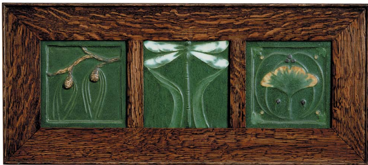
Northwoods Pine Cone Tile 6" x 6" #990 unframed