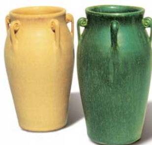
Boston Fern Cabinet Vase 5¼" x 3½" #063 SY (left), LG (right), CN, CP, SB