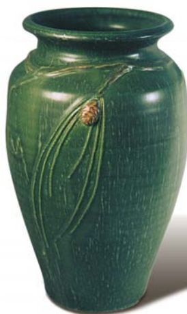
Northwoods Pine Cone Vase (Tall) 10" x 6¼" #902 LG