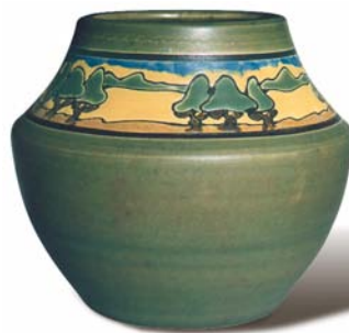
Oak Savannah Vase