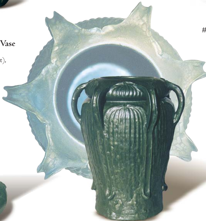
Seven-Handled Vase 11¾" x 10" #962 CU (shown), FC, BC, YC