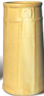
Bungalow Rose Vase 7½" x 4" #004 LG (left), SY (right), CN, CP, SB