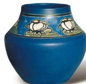
Water Lily Vase