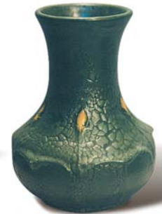
Budding Trumpet Vase 6¾" x 5¼" #960C CU (shown), FC, BC, YC #960 LG