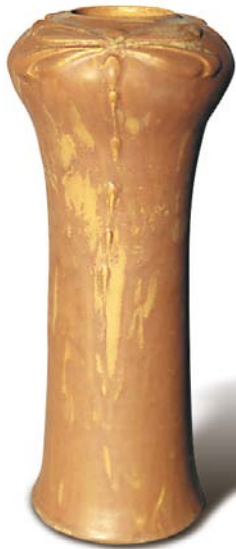
Damselfly Vase 11" x 4½" #003 ML (shown), LG with SY highlights