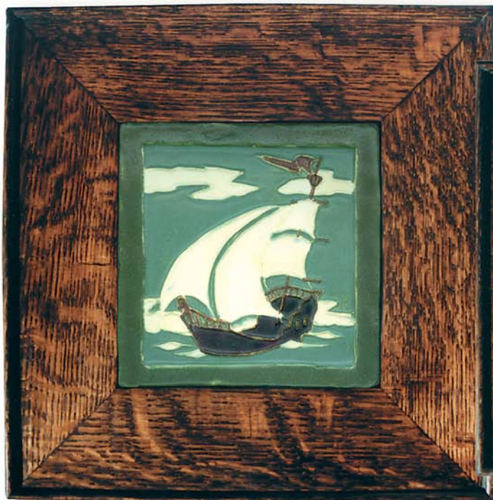
North Wind Tile 6" x 6" #097 unframed