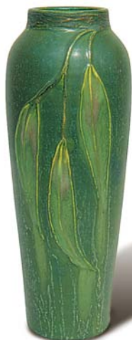
Pacific Eucalyptus Vase 11 1/2" x 4 1/2" #029 LG