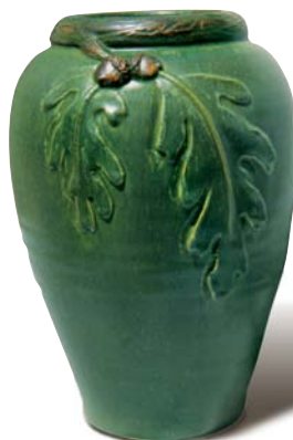
Valley Oak Vase (Tall) 9¾" x 6½" #028 LG