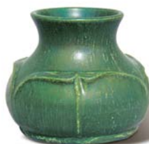
Spring Leaf Cabinet Vase 3½" x 3½" #064 LG (shown), CN, SY, CP, SB