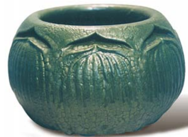
Harvest Centerpiece 5¼" x 10" #963 CU (shown), FC, BC, YC