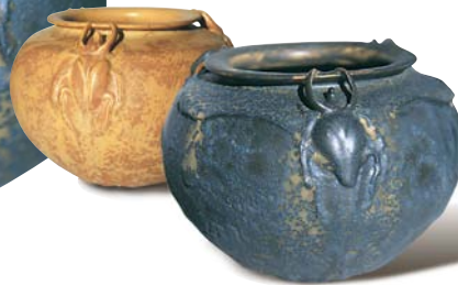
Rhinoceros Beetle Vase 5" x 7¼" #010 ML (left), BC (right), FC, CU, YC