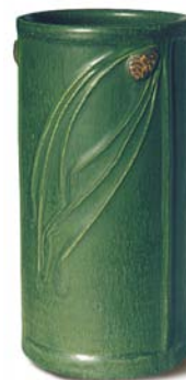
Northwoods Pine Cone Vase (Cylinder) 8" x 4" #900 LG