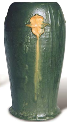
Yellow Iris Vase 12" x 6" #924C CU (shown) #924 LG