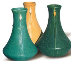
Narcissus Bud Vase 5 1/2" x 4" #920 SB (left), SY (center), LG (right), CN, CP