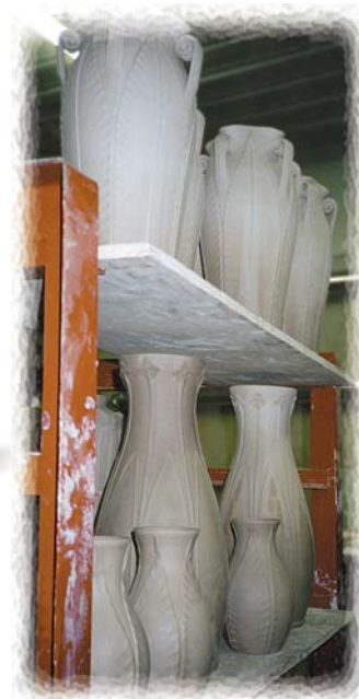
Green ware drying on wooden shelves in the EFP studio.