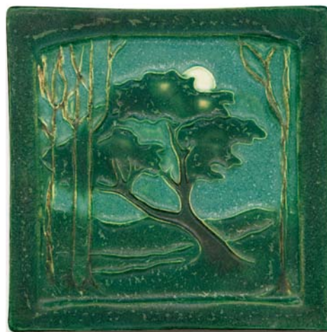
Walnut Hollow Tile 6" x 6" #094 unframed

Clockwise from top right: LG, CP, SB, SY