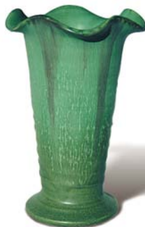
Prairie Storm Vase (Small) 7¾" x 4¾" # 910 variegated leaf green