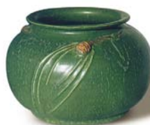
Northwoods Pine Cone Vase (Short) 4½" x 6" #901 LG