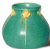
Buttercup Vase 4" x 5" #921 SB