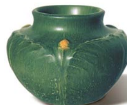
Brussels Vase 3½" x 5" #922 LG (shown), CN, SY, CP, SB