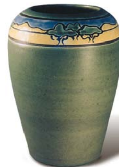
Cottonwood Grove Vase

Scott applies the pattern to each vase freehand. No two are exactly alike!