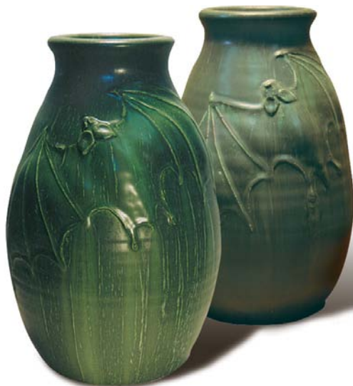
Bat Vase 10" x 6½" #823 LG (left), CN (right), CP