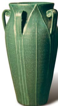
Boston Fern Vase 11" x 5¼" #813 LG (shown), CN, SY, CP, SB