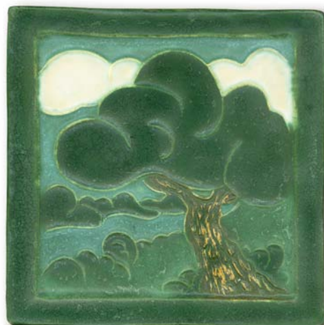
Elk Creek Tile 6" x 6" #095 unframed