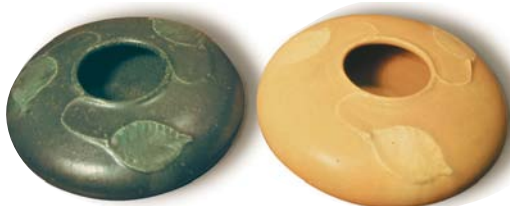
Leaf Impatiens Planter 2" x 6 1/4" #800 CN (left), SY (right), LG, CP, SB