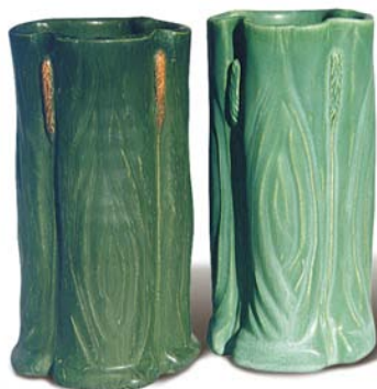
Woodland Cattail Vase 8" x 4" #951 LG (left), SG (right)