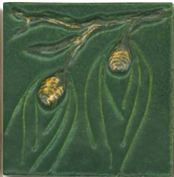
Pine Cone Tile 4" x 4" #080 unframed