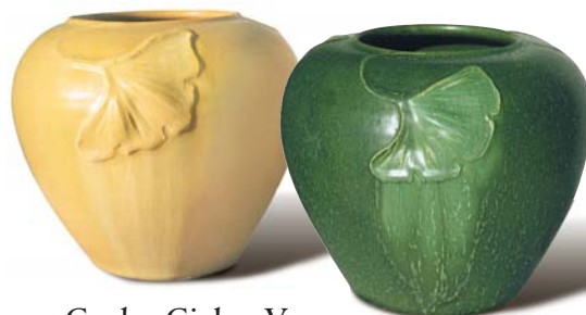
Garden Ginkgo Vase 6" x 7" #923 SY (left), LG (right), CN, CP, SB