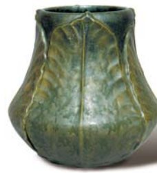
Begonia Vase 5½" x 5¼" #012 FC (shown), CU, BC, YC, ML