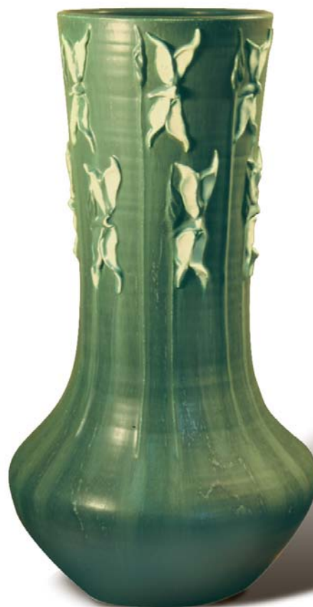
Perennial Vase 21" x 12" #802 LG