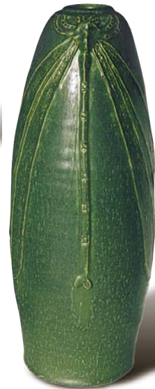
Dragonfly Vase 11½" x 4½" #817 LG (shown), CN, SY, CP, SB