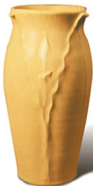
Bud Vase 9" x 4 1/2" #803 SY (shown), LG, CN #803C CU, BC, FC, YC