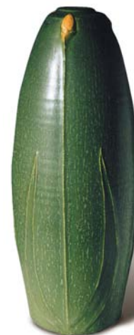
Day Lily Vase 11½" x 4½" #811 LG with SY buds (shown); CN with amber buds