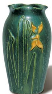
Iris Star Cabinet Vase 5¾" x 3¾" #062 LG (shown), SY, SB