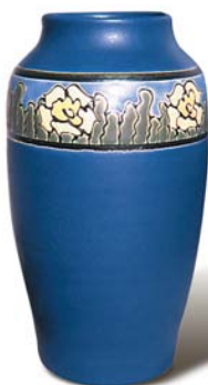
New Spring Daffodil Vase