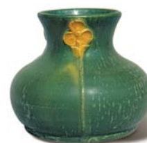
Prairie Flower Cabinet Vase 3½" x 3½" #060 LG (shown), SY, CN, SB