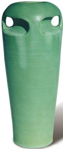
Large Four-Handled Vase 12½" x 4½" #807 SG (shown), LG, CN, SY, CP, SB

Here, in the heart of the Midwest, the Prairie style of architecture was born. Simple, linear designs reflect the sweeping expanses of prairie that cling to the gently rolling hills of southern Wisconsin. These vases exhibit clean, geometric patterns like those favored by architects of the Prairie School.