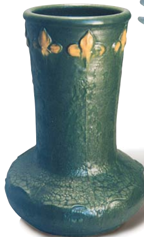
Pond Flower Vase 11" x 8¼" #964 CU (shown), FC, YC