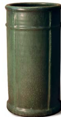
Prairie Cottage Vase 9" x 4¼" #814 CN (shown), LG, SY, CP, SB