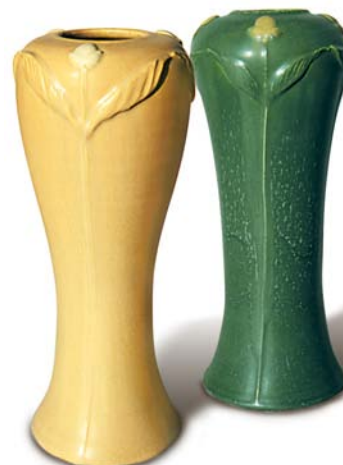
Meadow Flower Vase 11" x 4½" # 001 SY with white flowers (left); LG with SY flowers (right); SB with white flowers