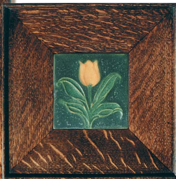
Tulip Tile 4" x 4" #984 unframed