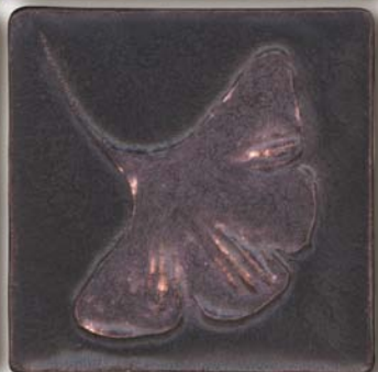
Ginkgo Tile 4" x 4"