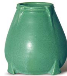
Oak Park Vase 5¾" x 5¾" #014 SG (shown), LG, SY, CN, CP, SB