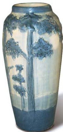
Ponderosa Pine Vase 9½" x 4½" #031 NB Newcomb Blue