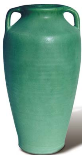
Amphora 12" x 6½" #952 SG (shown), LG #952C CU

When the piece is bone dry, it undergoes the bisque firing, after which it is hard and is ready to be decorated. The decorator applies the glazes, and the piece is fired again. Curdled pieces undergo two separate glaze firings. After firing, the foot is ground to remove excess glaze. In most cases, the entire process takes about three to four weeks, if no problems, such as cracking or breaking, occur along the way. The results of this labor-intensive process are the unique and stunning pieces shown in this catalog.