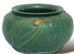
Northwoods Pine Cone Cabinet Vase 2¾" x 4½" #061 LG

These small vases are perfect additions to a bookcase or cabinet shelf.