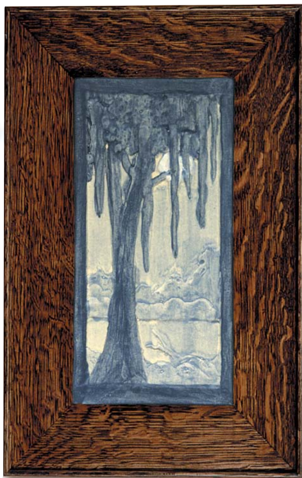
Spanish Moss Tile 4" w x 8" h #096 unframed