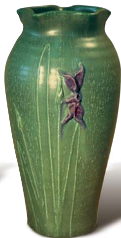
Iris Star Vase 11" x 5 3/4" #733 LG