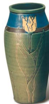
Dutch Tulip Vase