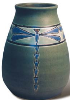
Prairie Dragonfly Vase