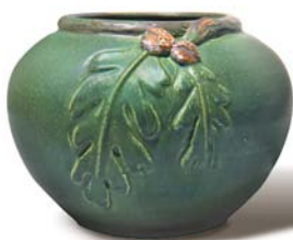
Valley Oak Vase (Short) 5" x 7" #027 LG