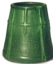
Bungalow Vase 5¾" x 5¾" #914 LG (shown), CN, SY, CP, SB