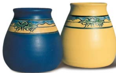
Cottonwood Grove Vase

Because pieces in this collection are created with stoneware clay and a different type of glaze, they are non-porous and can hold water. If you are concerned about protecting the inside of your vase from water stains and deposits, we advise using a glass or plastic liner.