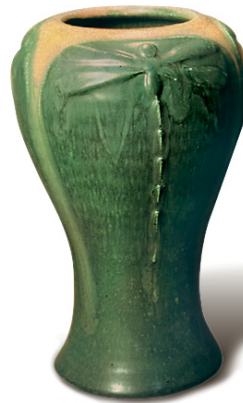
Darner Vase 8" x 5" #818 LG with amber high- lights (shown), CN with amber highlights