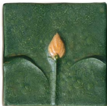
Bud Tile 4" x 4" #981 unframed

Note: Because our tiles are porous, they are not suitable for very wet environments, such as shower stalls or tub surrounds.