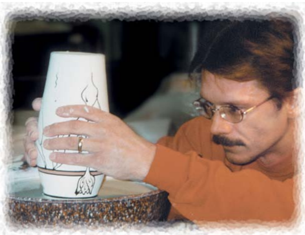
Glazing a Dutch Tulip vase.