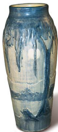
Spanish Moss Vase 9½" x 4½" #030 NB Newcomb Blue

The Landscapes collection also includes the Spanish Moss tile. In a unique 4" x 8" size, this tile is hand decorated and exhibits the same attention to detail as the vases. Consider combining a vase and tile to create a pleasing vignette.