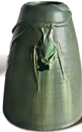
Hanging Bat Vase 8½" x 6¼" #017 CN (shown), LG, CP