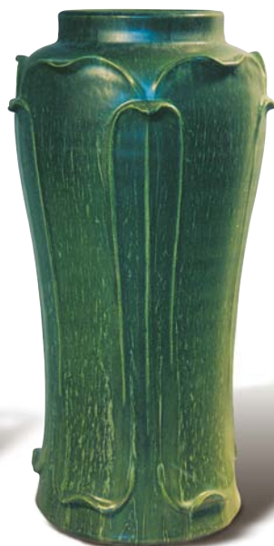
Reflection Vase 15" x 7" # 961 LG (shown), CN # 961C CU