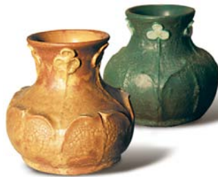
Curdled Prairie Flower Vase 5" x 5" #816 YC (left), CU (right), FC, BC