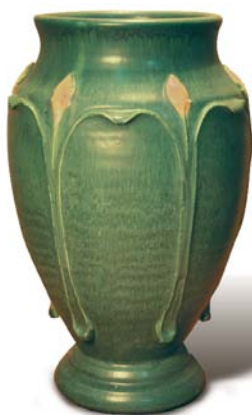
Greek Vase 10" x 5¾" #717 LG (shown), CN