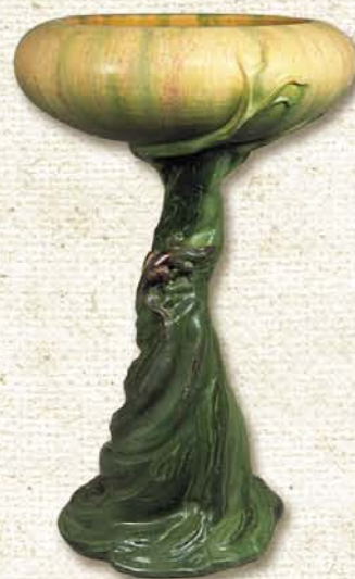
Forest Chalice 12 3/4" x 4 1/2" #122 DA