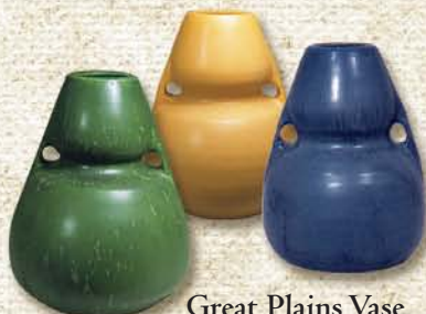
Great Plains Vase