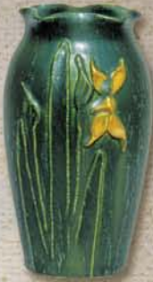
Iris Star Cabinet Vase 5¾" x 3¾" #062 LG (shown), SY, SB