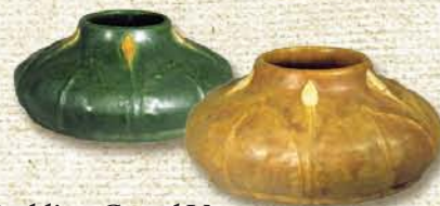
Budding Gourd Vase 3" x 5¼" #117 LG, CN, SY #117C YC (right), FC (left), CU