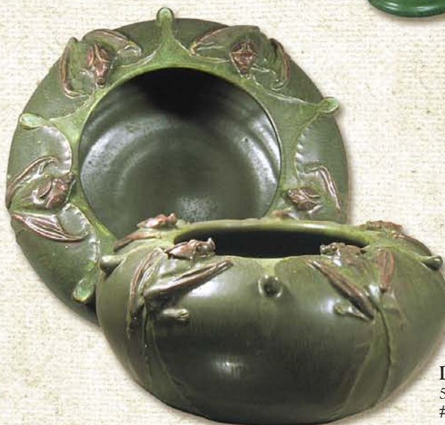
Dark Secrets Bowl 5" x 9¾" #111 CN