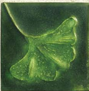
Ginkgo Tile 4" x 4" #980 LG (shown), SB, SY