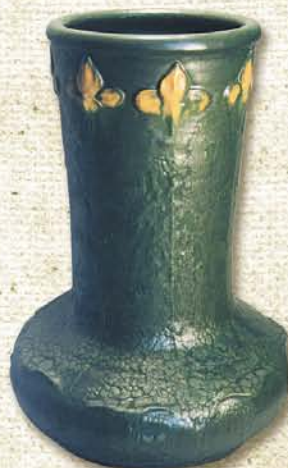
Pond Flower Vase 11" x 8¼" #964 CU (shown), FC, YC