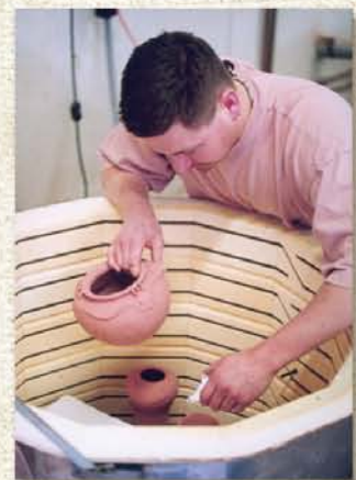
Loading the kiln.