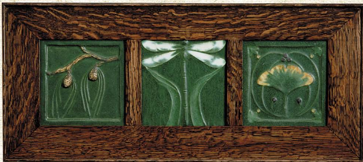
Northwoods Pine Cone Tile 6" x 6" #990