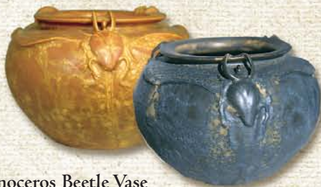
Rhinoceros Beetle Vase