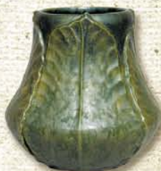
Begonia Vase 5½" x 5¼" #012 FC (shown), CU, BC, YC, ML, MC