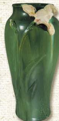
White Iris Vase 9¾" x 5¼" #112 LG