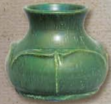
Spring Leaf Cabinet Vase 3½" x 3½" #064 LG (shown), CN, SY, CP, SB, IN