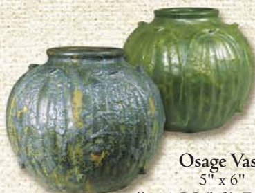
Osage Vase 5" x 6" #115 BC (left), FC (right), CU, MC, YC, ML