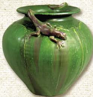
Curious Geckos Vase 7" x 8" #110 LG