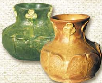
Curdled Prairie Flower Vase 5" x 5" #816 FC (left), YC (right), CU