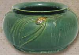
Northwoods Pine Cone Cabinet Vase 2¾" x 4½" #061 LG