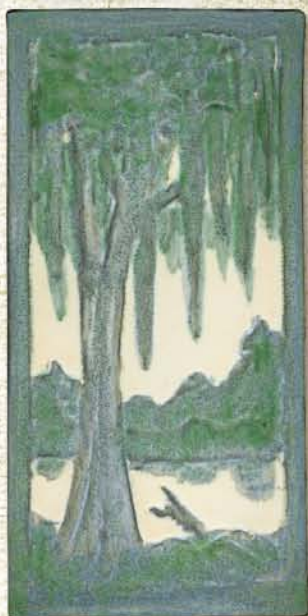
Spanish Moss Tile 4" w x 8" h #096