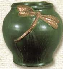
Copper Dragonfly Vase 5½" x 5"