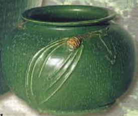
Northwoods Pine Cone Vase (Short) 4½" x 6" #901 LG