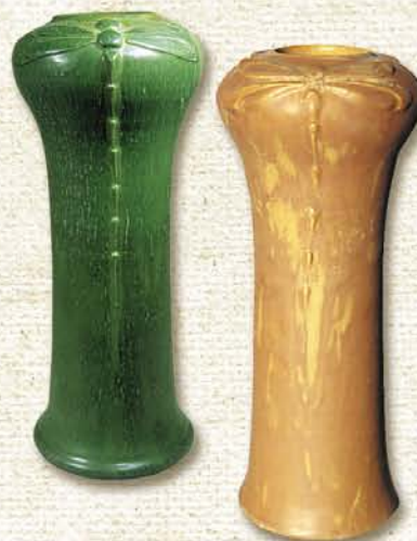
Damselfly Vase 11" x 4½" #003 ML (right), LG (left)