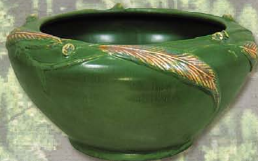
Pacific Eucalyptus Bowl 5¾" x 11½" #126 LG