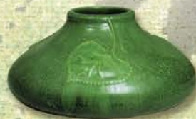
Native Poplar Vase 3½" x 6¼" #105 LG (shown), SY, CN, CP, SB