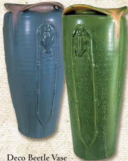
Deco Beetle Vase

#010 YC (left), BC (right), FC, CU, MC, ML