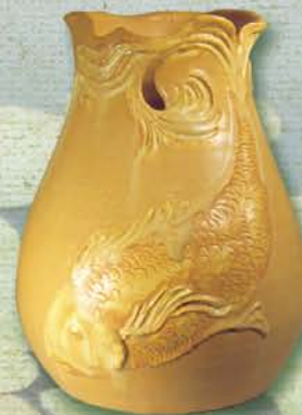
Koi Vase 9" x 7¼" #108 SY (shown), LG, SB