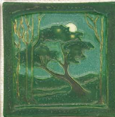
Walnut Hollow Tile 6" x 6" #094