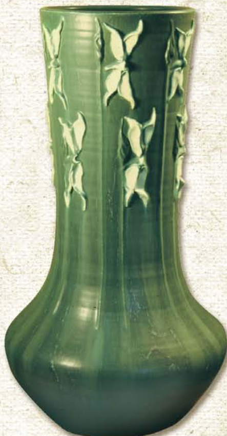
Perennial Vase 21" x 12" #802 LG