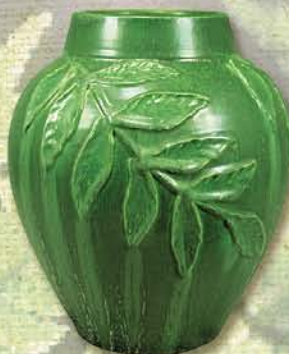
Sumac Vase 8¼" x 6¾" #104 LG (shown), SY, CN, SB, CP