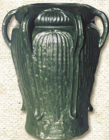
Seven-Handled Vase 11¾" x 10" #962 CU (shown), FC, BC, YC, MC