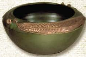
Copper Eucalyptus Bowl 3" x 7"