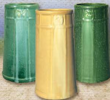
Bungalow Rose Vase