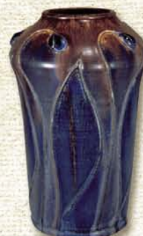
Budding Poppy Vase 8¼" x 5" #124 DU