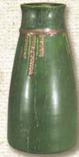
Copper Hubbard Vase 7¾" x 3"