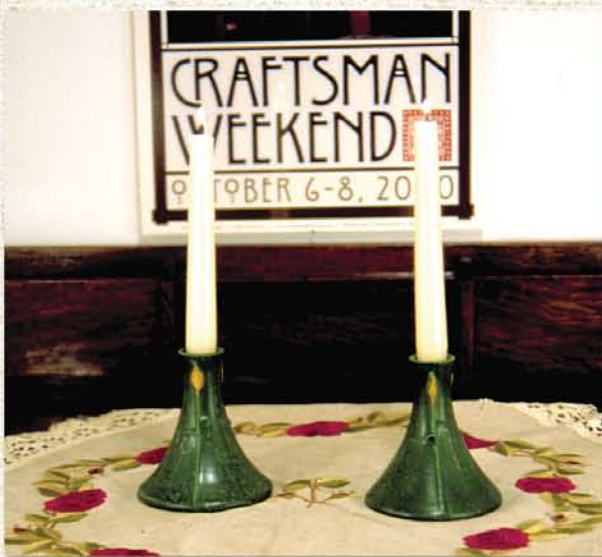
Budding Candlestick 4½" x 4"