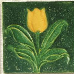
Tulip Tile 4" x 4" #984