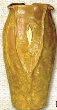
Bud Vase 9" x 4½" #803C CU, FC, YC (shown) #803 SY, LG, CN