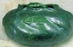
Fish Creek Bowl 3½" x 6¼" #106 MC