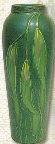
Pacific Eucalyptus Vase 11½" x 4½" #029 LG