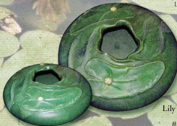
Lily Pond Vase 2" x 7" #107 LG