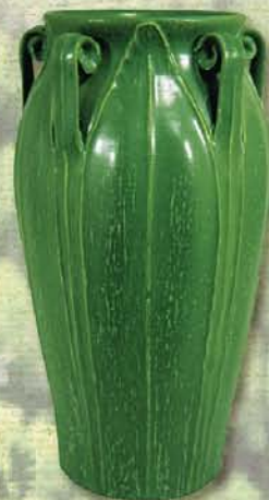
Boston Fern Vase 11" x 5¼" #813 LG (shown), CN, SY, CP, SB, IN, SG