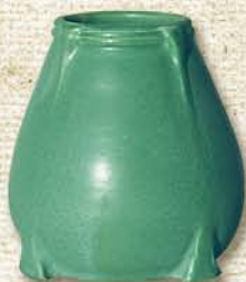
Oak Park Vase