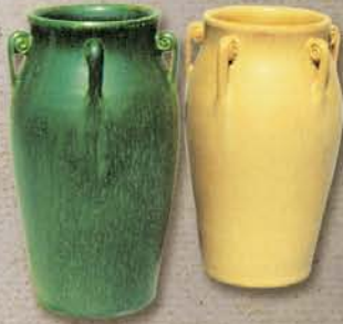
Boston Fern Cabinet Vase 5¼" x 3½" #063 LG (left), SY (right), CN, CP, SB, IN, SG

These small vases are perfect additions to a bookcase or cabinet shelf.