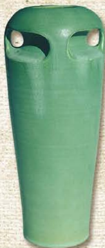
Large Four-Handled Vase