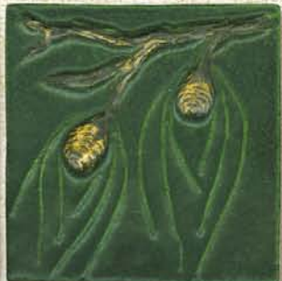
Pine Cone Tile 4" x 4" #080