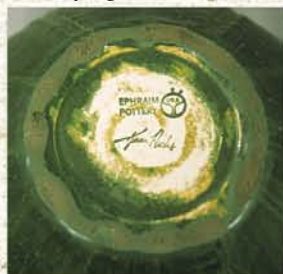
Foot of a faience vase made in 2001 by Kevin Hicks

In January of each year, we introduce new marks that are used for all pottery and tile made during the course of the year. In 2001, we are using two different marks. A larger, rectangular format is used for tile and vases with a wider foot. A smaller, circular mark is used for cabinet vases and other vases