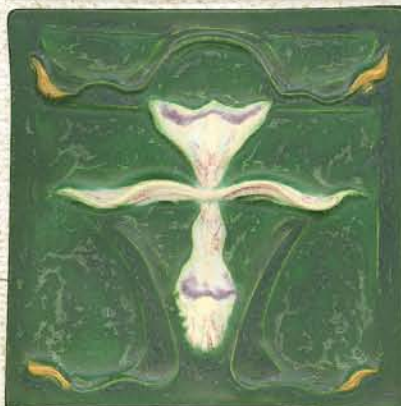
Lady's Slipper Tile 6" x 6" #191