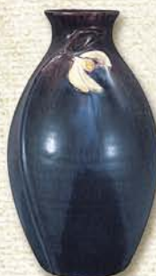
Snowdrop Vase 7½" x 4½" #114 DU