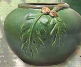
Valley Oak Vase (Short) 5" x 7" #027 LG