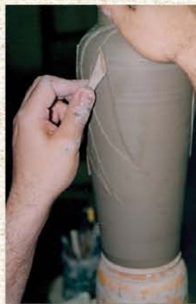
Kevin sculpting eucalyptus leaves.