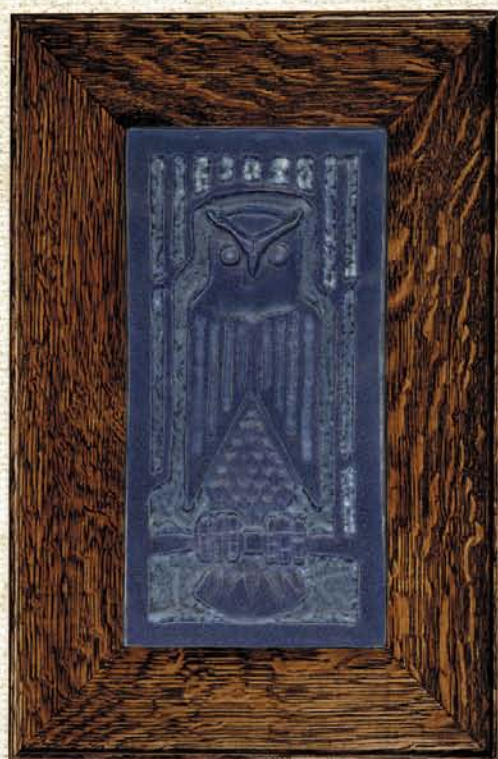
Owl Tile 4" x 8" #193 IN (shown), LG, CP