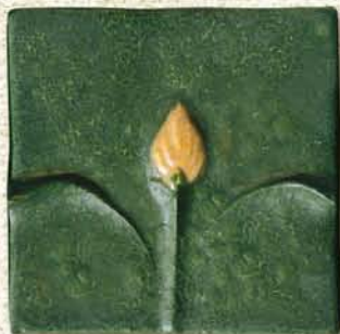
Bud Tile 4" x 4" #981

Note: Our tiles are porous. They are not suitable for very wet environments, such as shower stalls or tub surrounds.