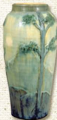
Ponderosa Pine Vase

We have freshened the look of our Newcomb College-inspired pottery. Our new color, Newcomb Green, is creamier and brighter, with more subtle gradations of tone. Our old Spanish Moss Vase has been enlarged, and is now the Summer Cypress Vase.