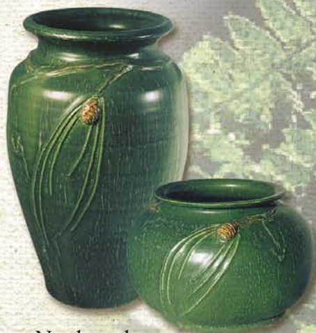
Northwoods Pine Cone Vase (Tall) 10" x 6¼" #902 LG