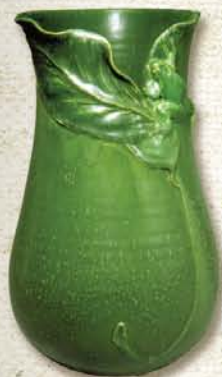
Climbing Tree Frog Vase 9" x 5" #123 LG