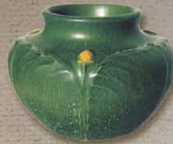
Brussels Vase 3½" x 5" #922 LG (shown), CN, SY, SB