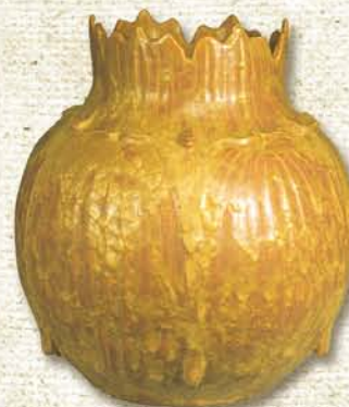
Harvest Squash Vase 8¾" x 8¼" #116 YC (shown), BC, CU, FC, MC, ML