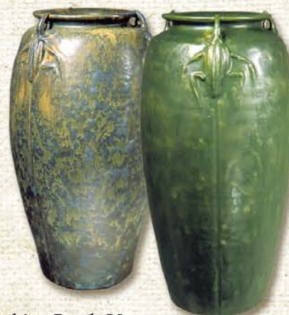
Climbing Beetle Vase 10½" x 5½" #118 BC (left), FC (right), CU, MC, YC, ML

EFP's pottery and tile has garnered high praise from the Arts and Crafts and art pottery communities. Our work has appeared in numerous national and regional publications, including American Bungalow, Arts & Crafts Designs for the Home, Architectural Digest, The Baltimore Sun, Country Living, Madison Magazine, North Park News, Old House Interiors, Prairie Style, The San Diego Union Tribune, Stickley Style, Style 1900, and The Wisconsin State Journal.