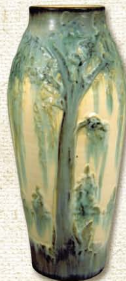
Summer Cypress Vase