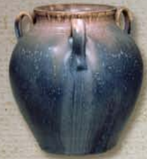
Three-Handled Cabinet Vase 4" x 4" #160 DU (shown), DA