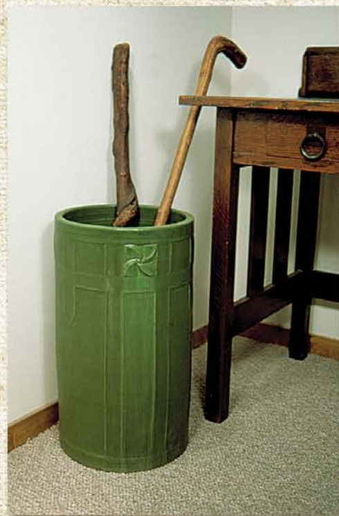
Bungalow Umbrella Stand