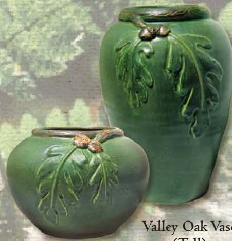
Valley Oak Vase (Tall) 9¾" x 6½" #028 LG