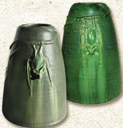
Hanging Bat Vase 8½" x 6¼" #017 CN (left), LG (right), CP, IN