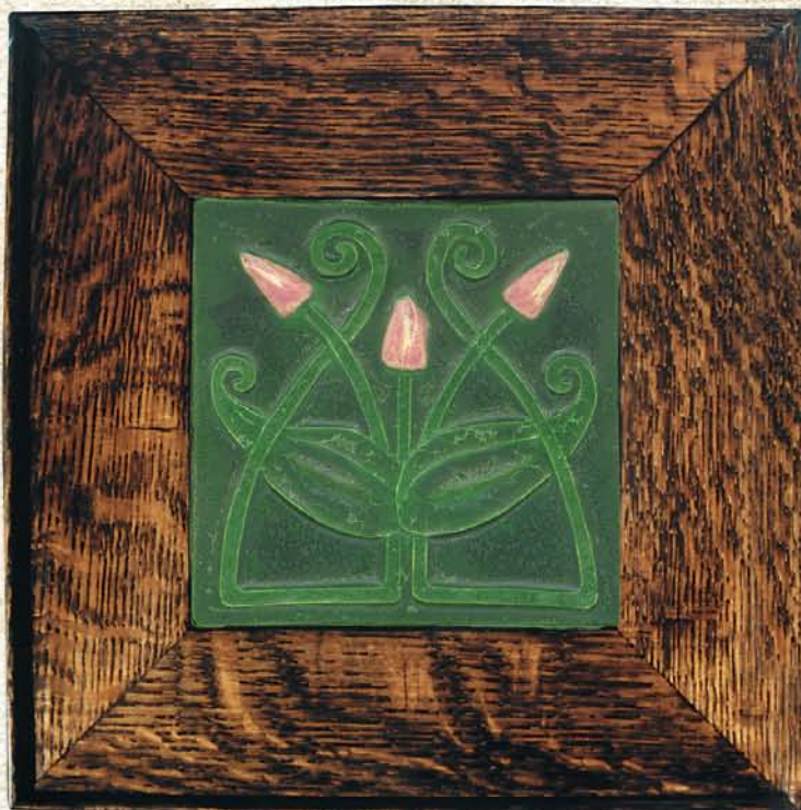
Reverie Tile 6" x 6" #192