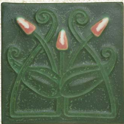
Reverie Tile . . . . . #192