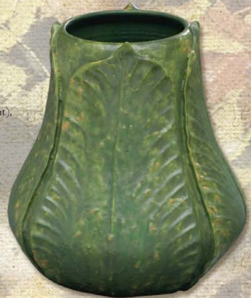
Large Begonia Vase 11 1/4" x 10 1/2" #228 FC (shown), CU, BC, YC, MC