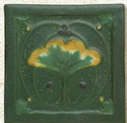
Starry Night Tile (top) . . . . . #390