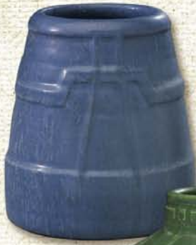
Cloud Rise Vase (left) 5½" x 4¼" #306 IN (shown), CN, CP, LG, PK, SB, SY