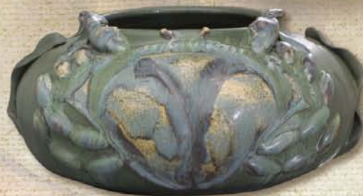
Underwater Crab Vase 4½" x 9½" #318 Color as shown