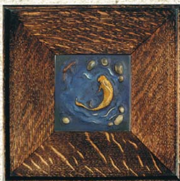
Frame for 4" x 4" Tile