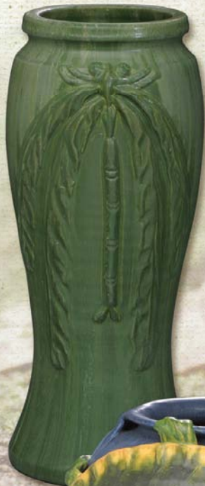
Majestic Dragonfly Vase 13¼" x 6½" #319 MO