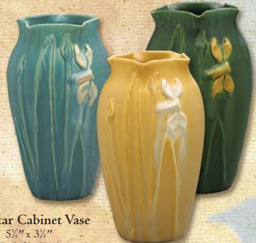
Iris Star Cabinet Vase 5¼" x 3¼" #062 SB (left), SY (center), LG (right)