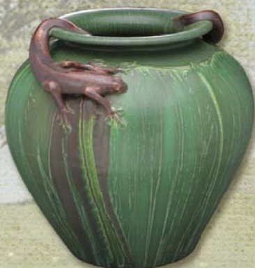
Curious Geckos Vase 7" x 8" #110 Color as shown