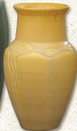
Nightingale Vase (left)