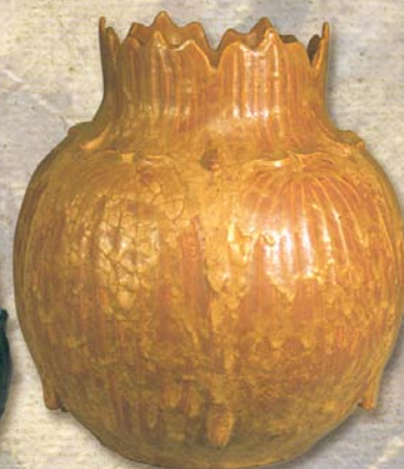
Harvest Squash Vase 8½" x 8½" #116 YC (shown), BC, CU, FC, MC