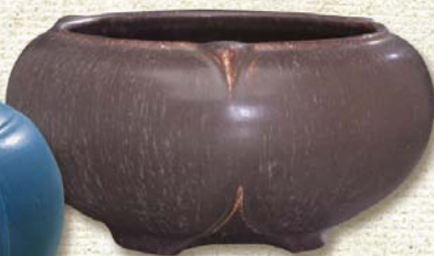
Three Graces Bowl