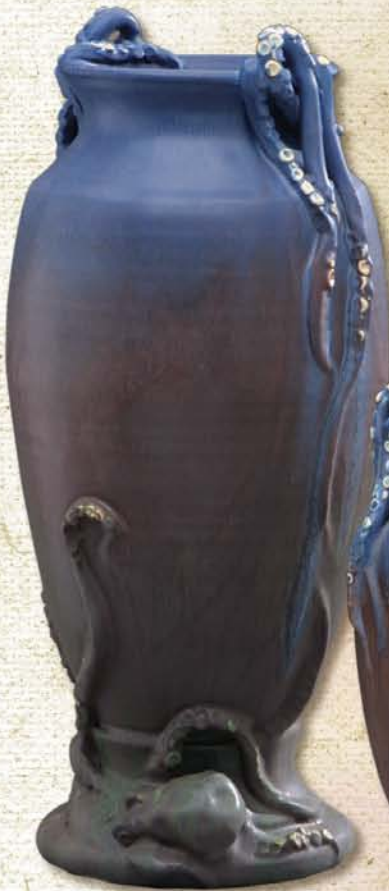
Large Deep-Sea Octopus Vase 17" x 6½" #234 Color as shown