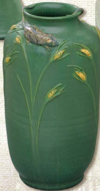
Field Mouse Vase 10¼" x 5¼"