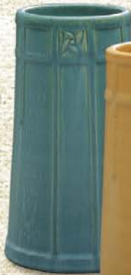
7½" x 4" #004 SB (left), SY (right), LG, CN, CP, IN, PK