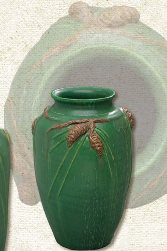
White Pine Vase 9¼" x 5½"