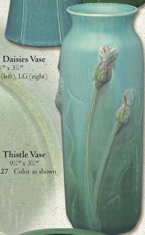
Thistle Vase 9\frac{3}{4}'' \times 3\frac{3}{4}'' #327 Color as shown