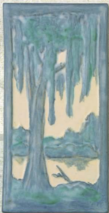
Spanish Moss Tile 4" x 8" #096 Color as shown