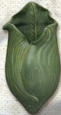
Leaf Wall Pocket 8 1/4" x 3 1/4" #320 Color as shown