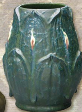
Hosta Vase 7" x 5" #245C MC