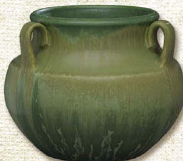
Spring Valley Vase (right)