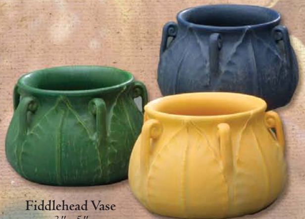
Fiddlehead Vase 3" x 5" #226 LG (left), SY (front), IN (back), CP, CN, SB, PK