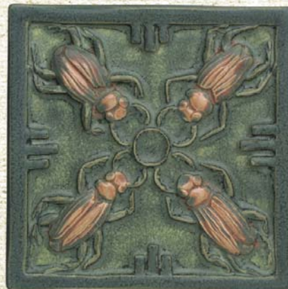
Ancient Scarabs Tile . . . . #296