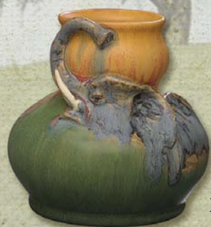
Elephant Vase 5½" x 5¼" #312 Color as shown