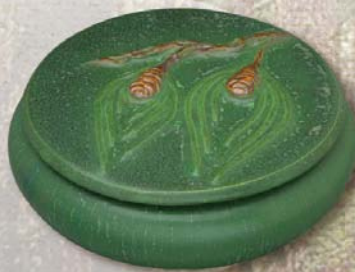
Valley Oak Vase (Short) 5" x 7"