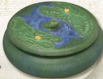
Frog Pond Box 3½" x 6¼" #378 Color as shown