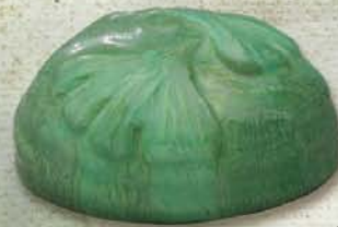
Falling Ginkgo Paperweight 1 1/2" x 3 1/4" #271 LG (shown), SY, CP, SB, CN, IN, PK