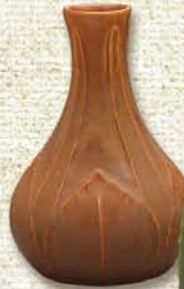
Peaceful Prairie Vase 6 1/4" x 4 1/4" #321 PK (shown), CN, CP, IN, LG, PK, SB, SY