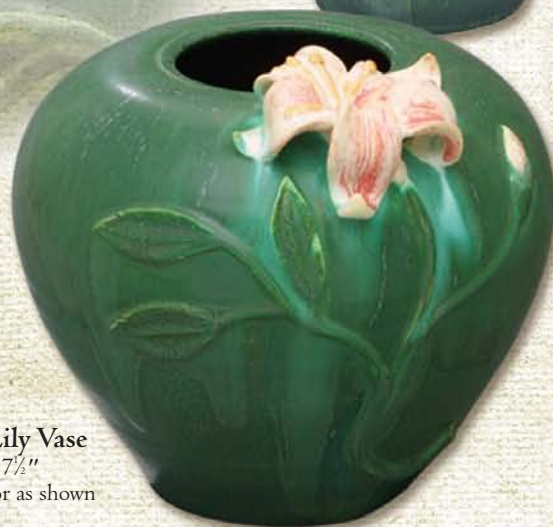
Garden Lily Vase 6\frac{1}{4}'' \times 7\frac{1}{2}'' #232 Color as shown