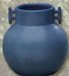
Temple Gate Vase 5" x 5"

These pieces exhibit our modern interpretation of Japonisme, as seen through the lens of contemporary Arts and Crafts. The koi, or Asian goldfish, is a traditional motif in Japanese art, and the handles on the Temple Gate Vase reflect the lines of a Shinto temple. In Japan, the frog is a traditional symbol of good luck, connoting auspiciousness and prosperity. The waterfall is a common element in traditional Japanese gardens.