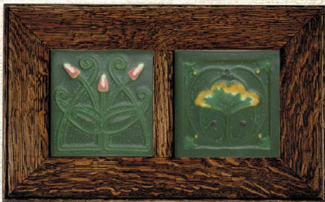
Diptych Frame for 6" x 6" Tiles #TD6