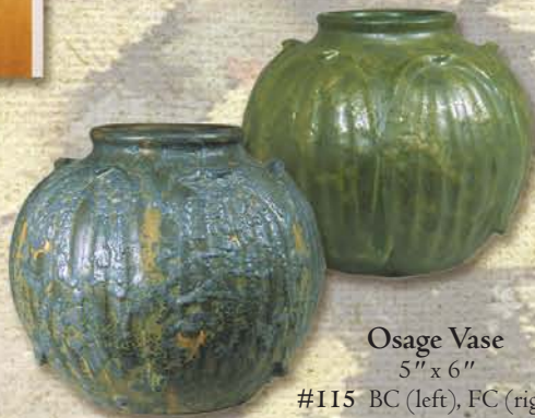
Osage Vase 5" x 6" #115 BC (left), FC (right), CU, MC, YC