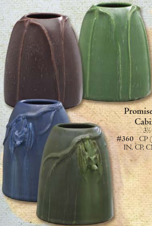
Promise of Spring Cabinet Vase 3½" x 3¼" #360 CP (left), LG (right), IN, CP, CN, PK, SB, SY

These small vases are perfect additions to a bookcase or cabinet shelf.