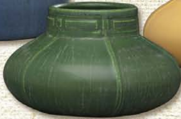
Yellowstone Vase 3½" x 5¼" #302 LG (center), SY (right), CN, CP, SB, IN