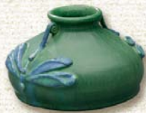
Curly-Tailed Dragonfly Vase 3" x 4½" #225 Color as shown