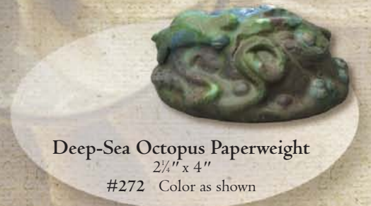
Deep-Sea Octopus Paperweight 2¼" x 4" #272 Color as shown