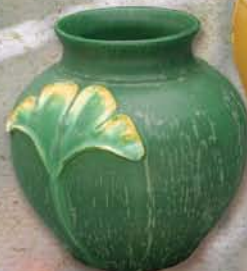
Nostalgia Vase 5 1/4" x 4 1/4" #243 Color as shown