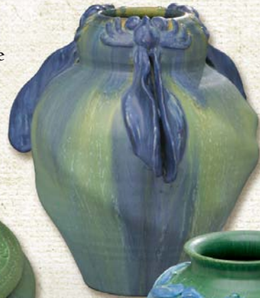
Water Dragonfly Vase 8" x 6¼" #317 Color as shown