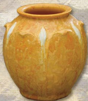
May Bud Vase 5½" x 5½" #230C YC (shown), CU, FC