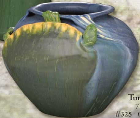
Turtle Vase 7" x 8¼" #325 Color as shown