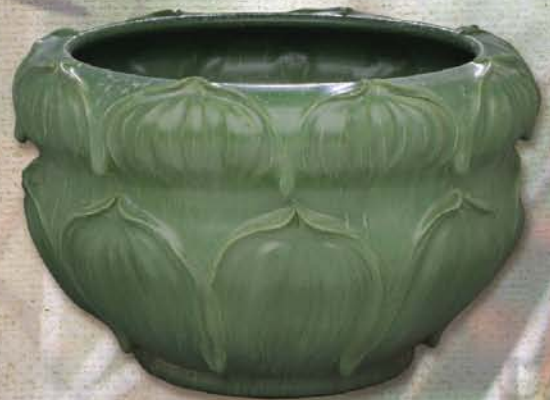
Harvest Jardiniere 7 1/4" x 11" #326 LG (shown), CN, CP, IN, PK, SB, SY