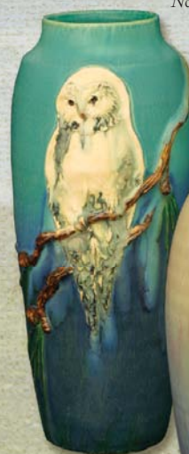
Snowy Owl Vase No longer available