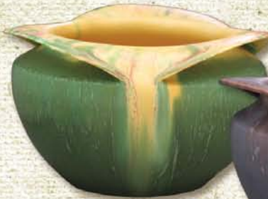
Monona Vase 4" x 5" #127 DA (left), DU (right)