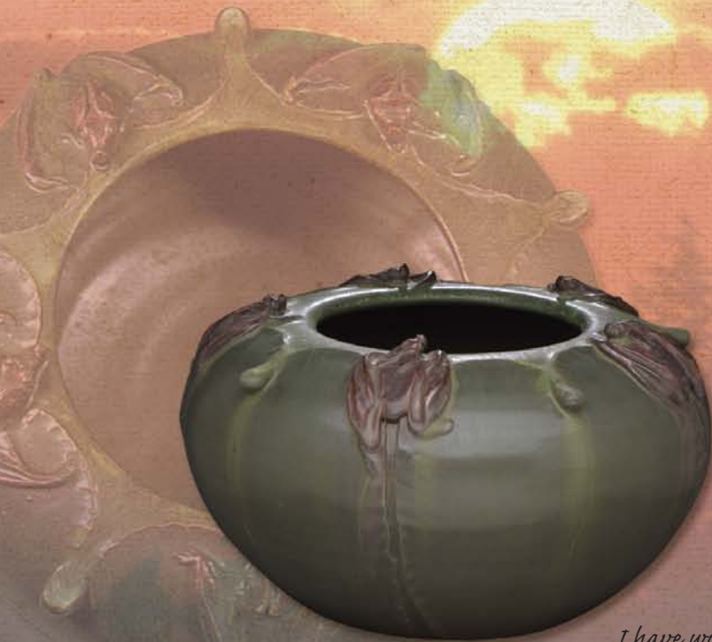
Dark Secrets Bowl 5" x 9 1/2" #III CN

I have worked in pottery for 17 years now. I can honestly say I still love taking that small piece of earth and instilling a little of my soul in it to bring it to life.