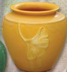
Falling Ginkgo Vase 5" x 4 1/4" #244 SY (shown), LG, CP, SB, CN, IN, PK