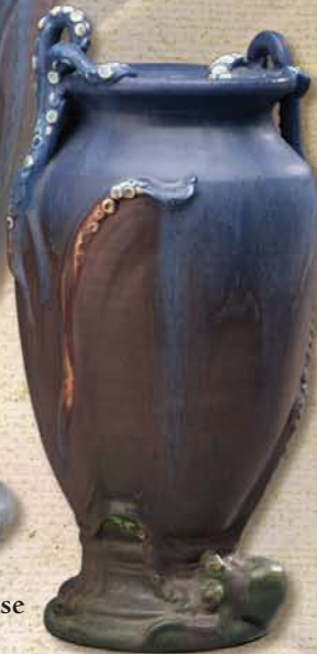
Deep-Sea Octopus Vase 11" x 6" #233 Color as shown