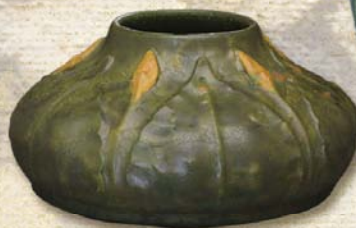
Budding Gourd Vase 3" x 5½" #117C FC (shown), YC, CU