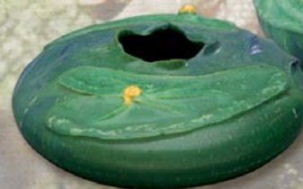
Lily Pond Vase (left) 2" x 7" #107 Color as shown