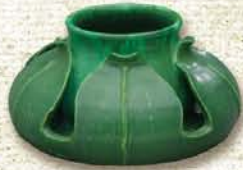
Spring Bud Vase 3" x 6 1/4" #224 Color as shown