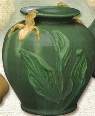
Lady's Slipper Vase 5 1/4" x 5 1/2"