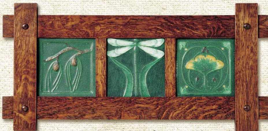
Lap Joint Triptych Frame for 6" x 6" Tiles