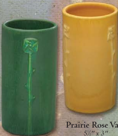
Prairie Rose Vase 5½" x 3" #239 LG (left), SY (right), IN, CP, CN, SB, PK