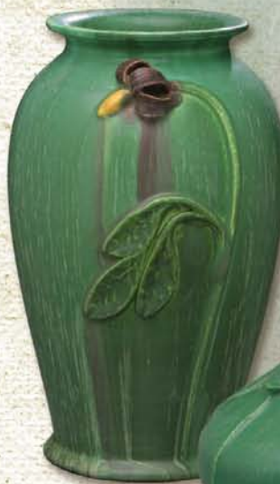
Nightshade Vase (left) 6\frac{1}{4}'' \times 4\frac{1}{4}'' #310 Color as shown