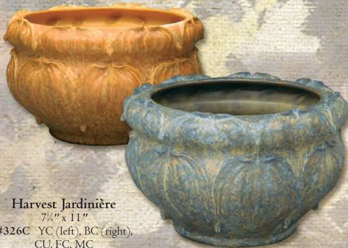
Harvest Jardinière 7 1/4" x 11" #326C YC (left), BC (right), CU, FC, MC