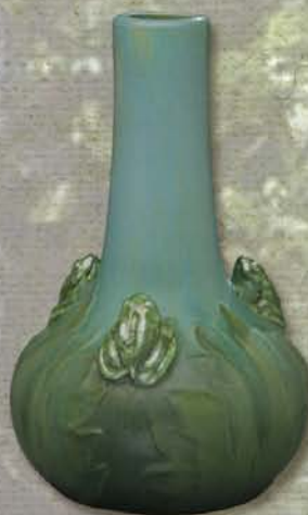
Meditating Frogs 9 1/4" x 5 1/4"