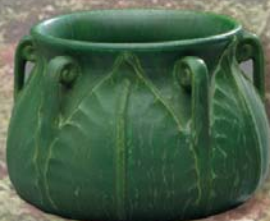
Fiddlehead Vase 3" x 5"