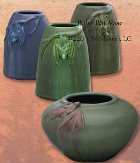
Baby Bat Vase 3 1/4" x 5 1/2"