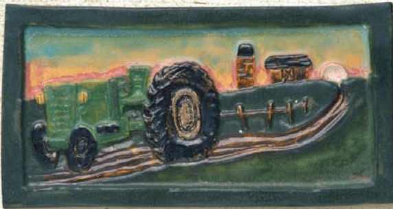
Down on the Farm Tile (4"×8") #391