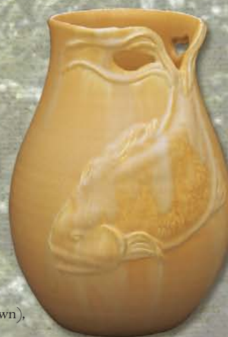
Koi Vase 9" x 7 1/4"