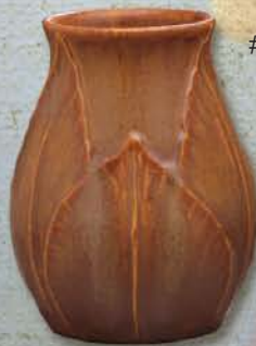
Hanging Bat Cabinet Vase 4¼" x 3½" #361 IN (left), CN (right), CP, LG