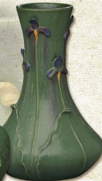
Large Wild Iris Vase 10" x 7"