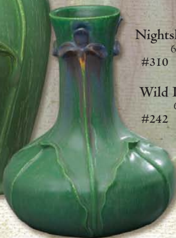
Wild Iris Vase (right) 6'' \times 4\frac{1}{2}'' #242 Color as shown