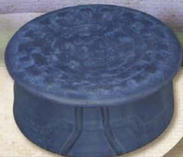
Cloud Rise Box 2¼" x 6½" #375 IN (shown) CN, CP, LG, PK, SY

EFP's pottery and tile has garnered high praise from the Arts and Crafts and art pottery communities. Our work has appeared in numerous national and regional publications, including American Bungalow , Arts & Crafts Designs for the Home , Architectural Digest , The Baltimore Sun , Country Living , Madison Magazine , North Park News , Old House Interiors , Old House Journal , Prairie Style , The San Diego Union Tribune , Stickley Style , Style 1900 , The Wisconsin State Journal , and Wisconsin Trails .