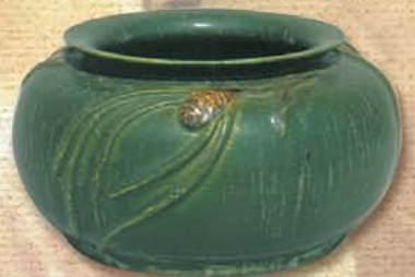
Northwoods Pine Cone Cabinet Vase 2¾" x 4½" #061 Color as shown