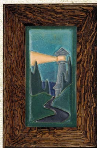
Oak Frame for 4" x 8" Tile #TF8

*Can also be hung vertically upon request