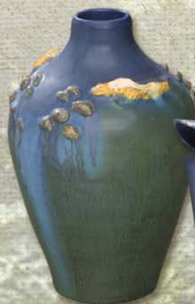
River Falls Vase 8 1/4" x 6 1/4"