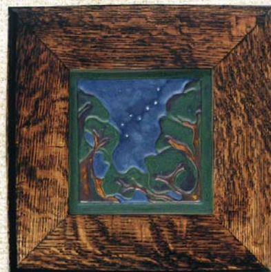
Frame for 6" x 6" Tile

*Can also be hung vertically upon request