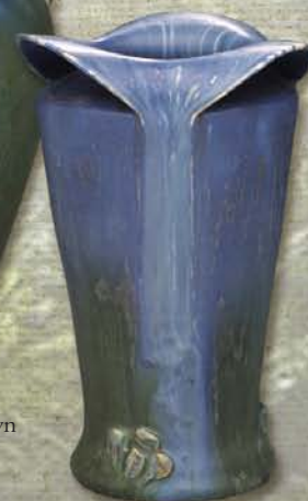
Waterfall Vase 8" x 4 1/4"