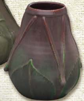
Coleus Vase 6 1/2" x 5" #223 Color as shown