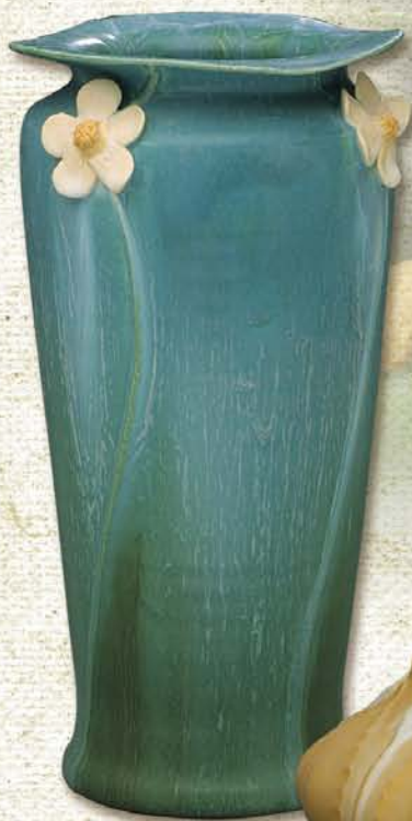
May Apple Vase 9 1/4" x 4 1/2"