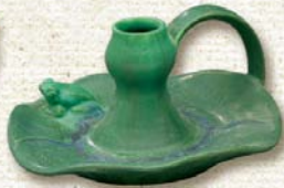
Frog Pond Candleholder 3" x 5¼" #212 Color as shown