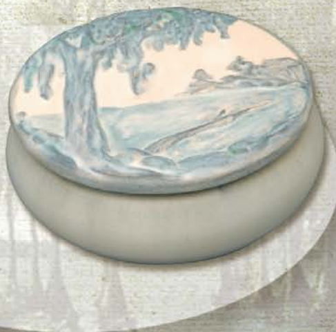
Spanish Moss Box 2 1/2" x 5 1/2" #379 Color as shown