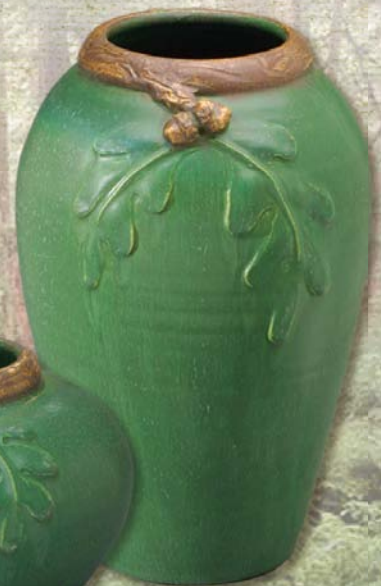
Valley Oak Vase (Tall) 9¼" x 6¼"