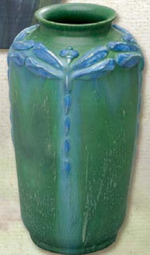
Blue Dragonfly Vase 9½" x 5" #222 Color as shown