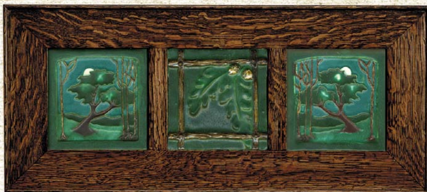
Triptych Frame for 6" x 6" Tiles #TR6