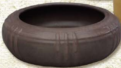
Dakota Plains Bowl 2¾" x 8" #202 CP (shown), LG, CN, SY, SB, IN, PK