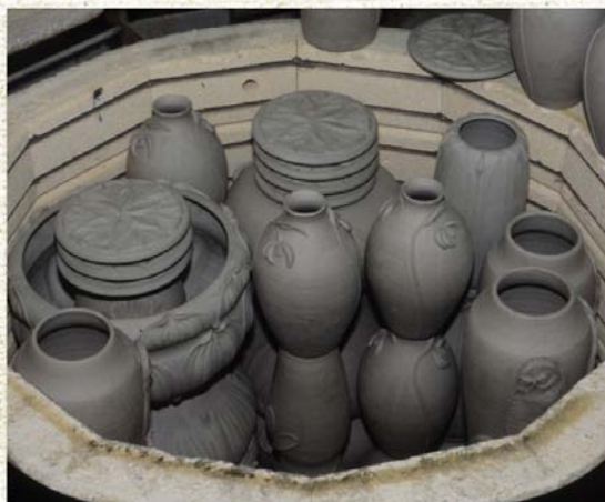
A kiln loaded with green ware