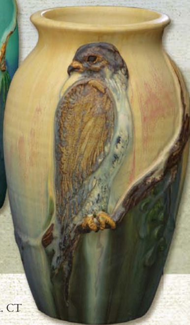
Falcon Vase 11¼" x 7¼"

#301 Color as shown On sale 8/15/03 at 9:00 a.m. CT (see below).