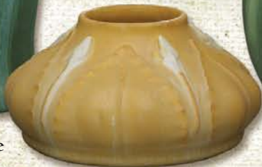
Budding Gourd Vase 3" x 5 1/4"