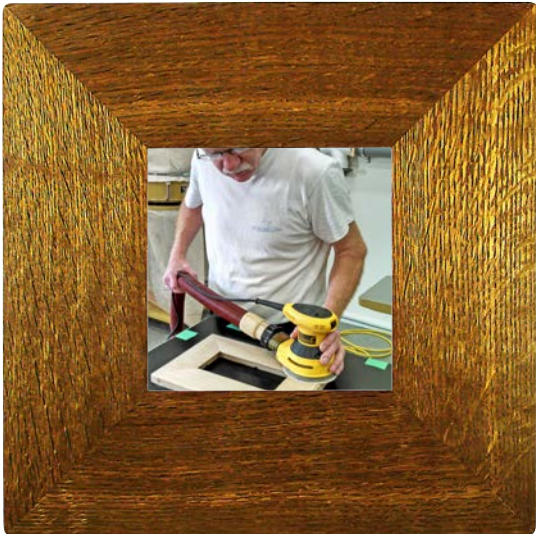
Frames are sanded in multiple steps to a buttery-smooth finish.

The measurements shown are the outside dimensions of the frame. Our frames are made