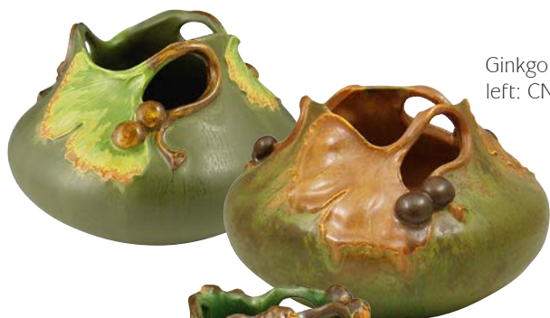
Ginkgo Branch