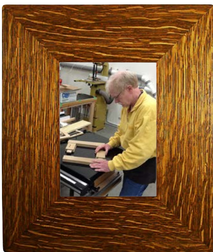
Frames are made with mortise-and-tenon joints; no metal hardware is used to join the sides.