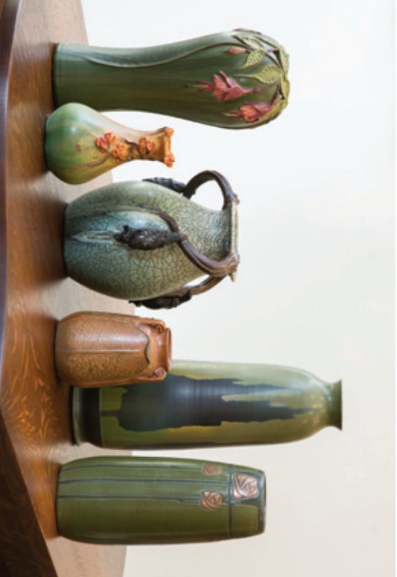
EPHRAIM POTTERY STUDIO COLLECTION 2016

728 Main Street Cambria, CA 93428 805-924-1275