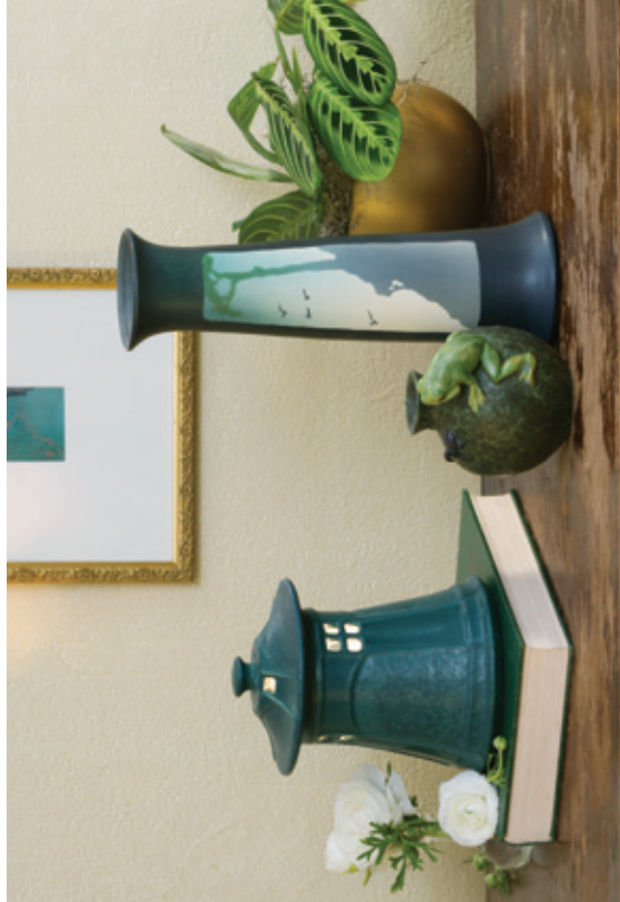
EPHRAIM POTTERY STUDIO COLLECTION 2017