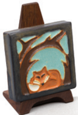
Little Fox Tile $38

L42 A little fox curls up beneath a tree and happily dreams of spring's arrival. The bold, sculpted linework references stained glass techniques and mirrors other popular tiles in our collection rendered in this same style.