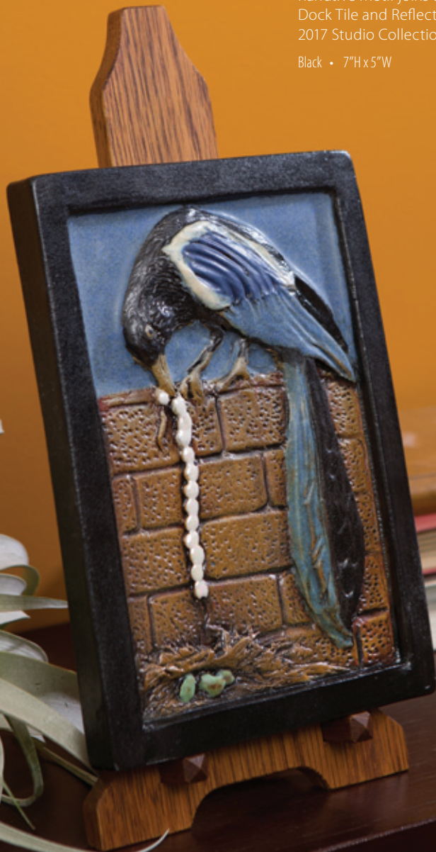
ES7 Tile Stand $56 • Holds a 7" x 5" tile • White Oak • 10"H x 5"W