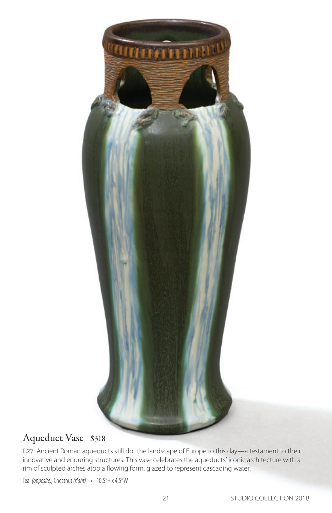
Aqueduct Vase $318

Curdled Teal (additional colors available) • 5.50"H x 5.25"W