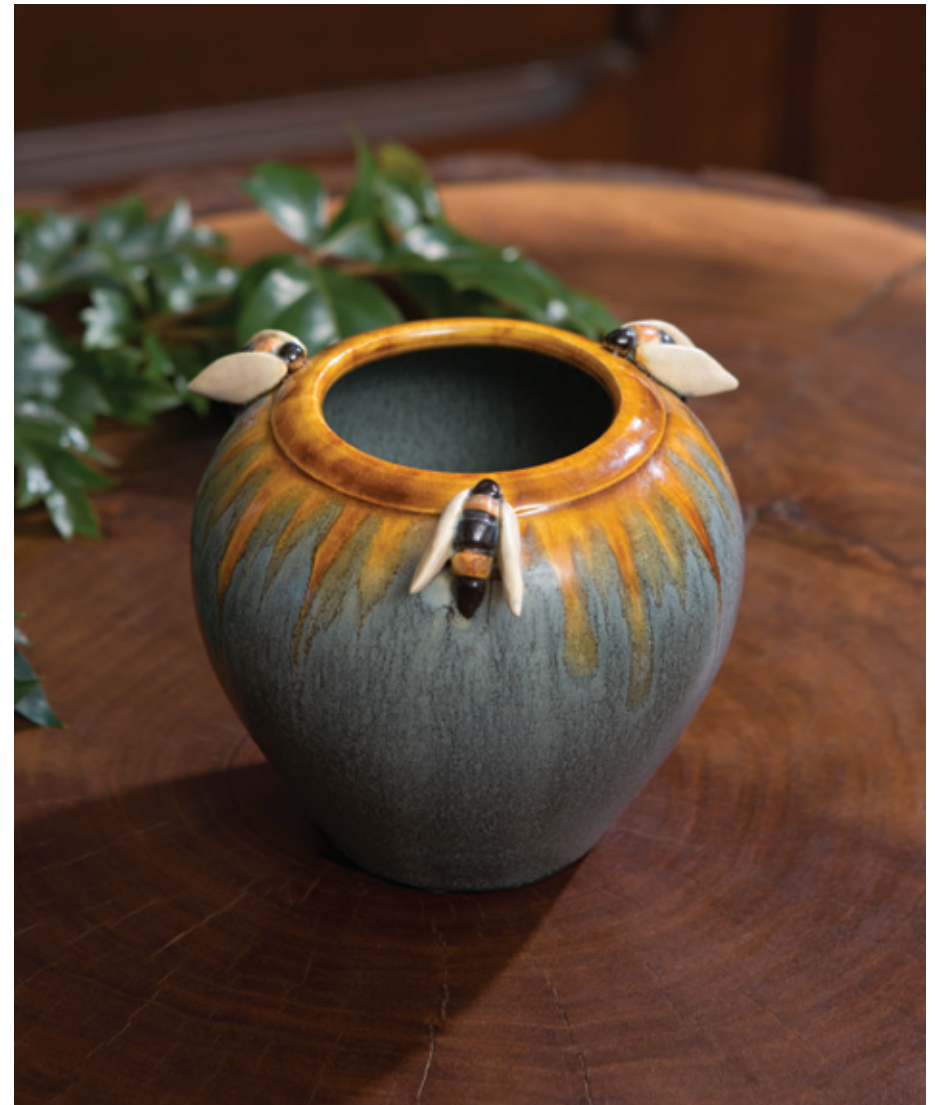
Bees Cabinet Vase $148

L33 Sometimes the world's smallest creatures deserve the most careful attention. Three little bees crown the rim of this sweet cabinet vase and invite you to notice their intricate sculpting and unique glaze application. Notice the bees' delicate wings, the bees' patterned bodies, the bees' important role in the ecosystem as pollinators.