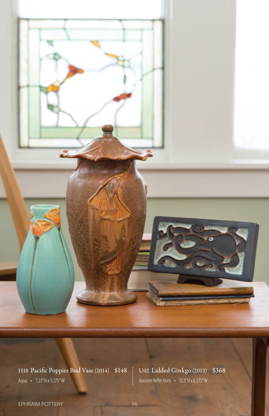
H18 Pacific Poppies Bud Vase (2014) $148 Aqua • 7.25"H x 3.375"W