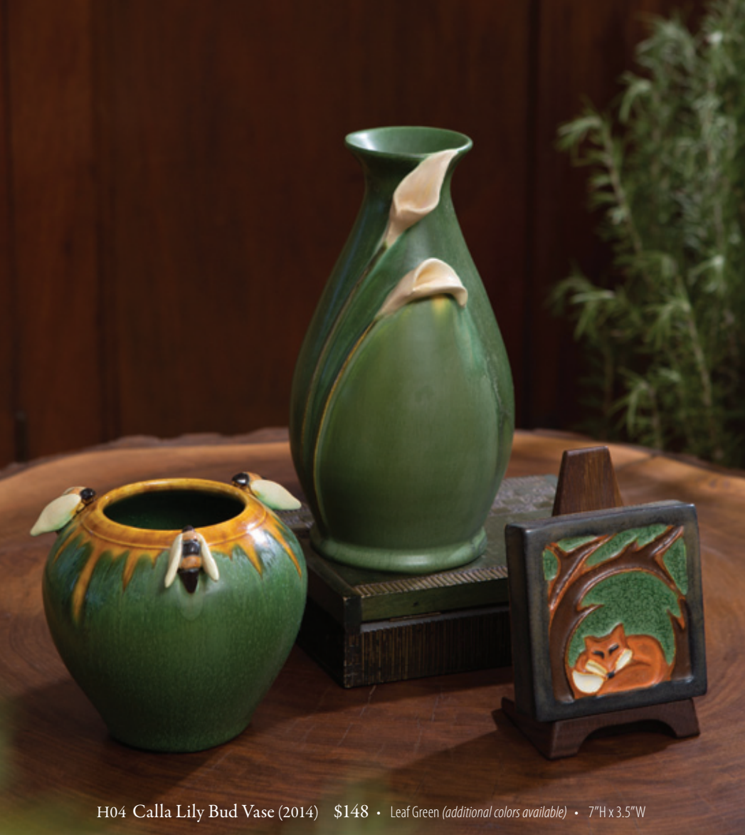
H04 Calla Lily Bud Vase (2014) $148 • Leaf Green ( additional colors available ) • 7"H x 3.5"W