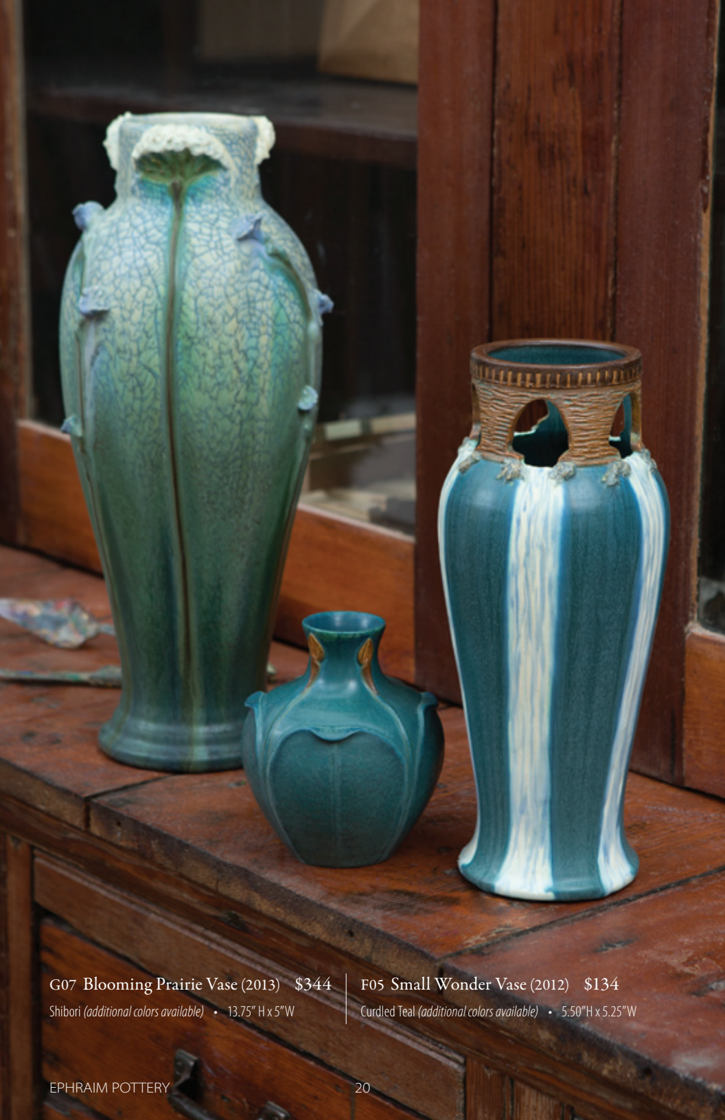
G07 Blooming Prairie Vase (2013) $344

Shibori (additional colors available) • 13.75" H x 5"W