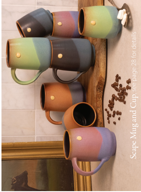
Scape Mug and Cup, see page 28 for details

SHOP THE 2024 COLLECTION AND MORE ONLINE