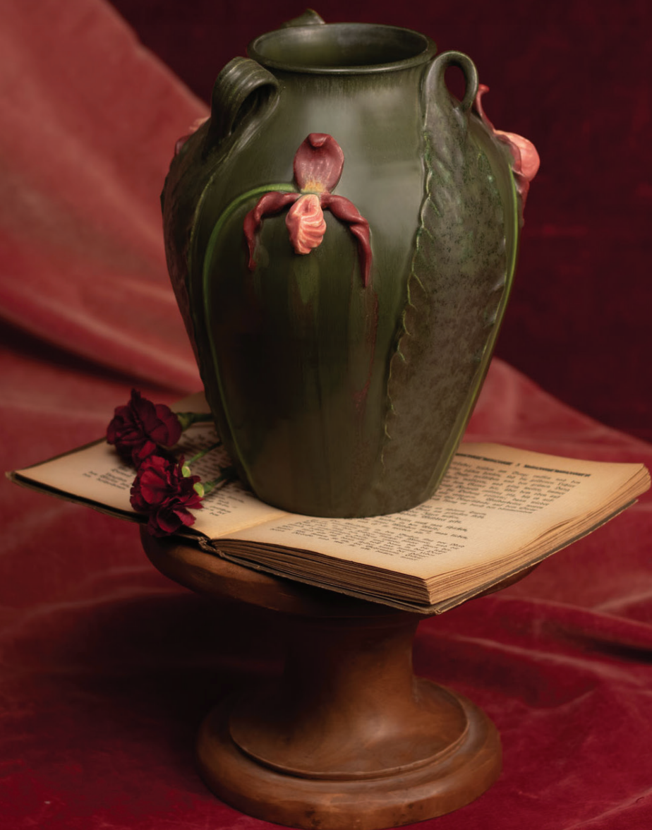
Slipper Orchid Vase, see page 2 for details