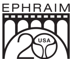
20 TH ANNIVERSARY 2016-2017 (LARGE)